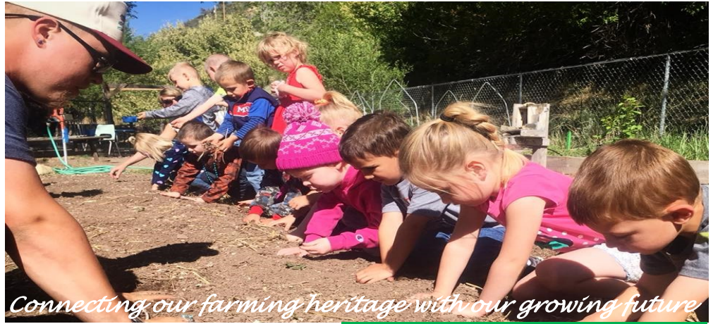
Connecting our farming heritage with our growing future